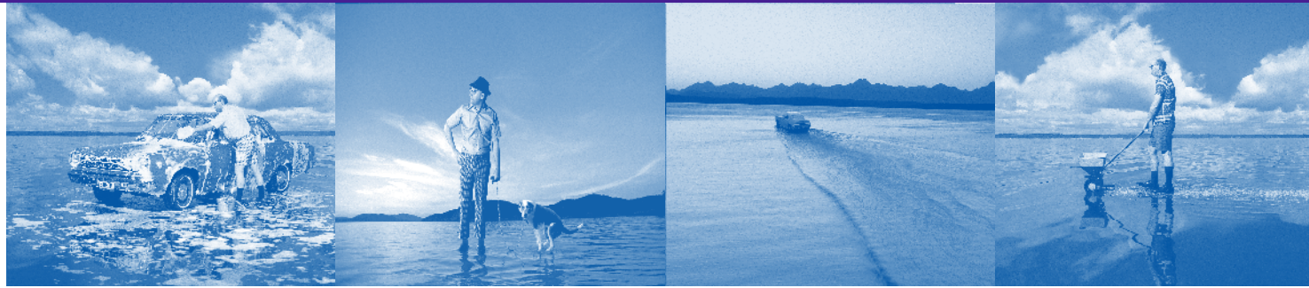
Thanks to the Washington State Department of Ecology, King County, and the cities of Bellevue, Seattle, and Tacoma for these photos.